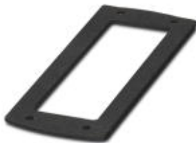
Flat gasket made of NBR, size B10

Please be informed that the data shown in this PDF Document is generated from our Online Catalog. Please find the complete data in the user's documentation. Our General Terms of Use for Downloads are valid ( http://phoenixcontact.com/download )