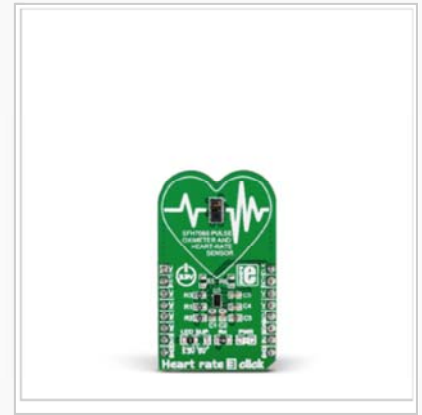
Heart rate 3 click