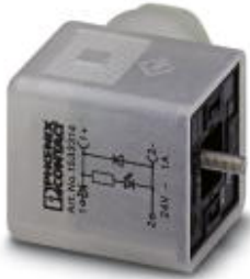
Valve connectors, 3-position, Valve connector A, with 1 LED, connected with Damping diode, Screw connection, cable gland Pg9, external cable diameter 6 mm ... 8 mm

Please be informed that the data shown in this PDF Document is generated from our Online Catalog. Please find the complete data in the user's documentation. Our General Terms of Use for Downloads are valid ( http://phoenixcontact.com/download )